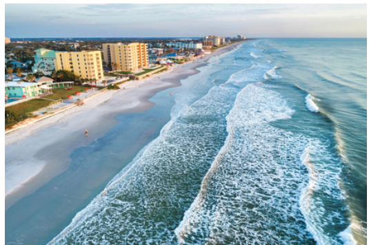
Catch some sun and take a drive on New Smyrna Beach