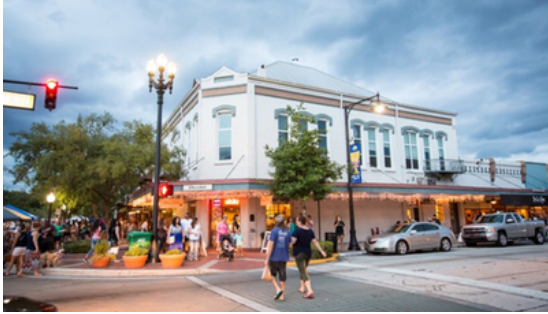
Explore Downtown DeLand (Voted America's Main Street!)