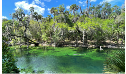
Swim, snorkel, or kayak in beautiful Blue Springs State Park