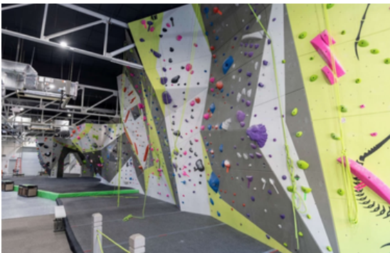
Check out Dynoclimb, DeLand's Premier Indoor Rock Climbing Center